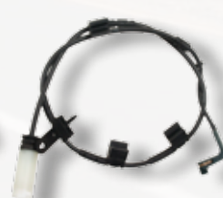
Mini Cooper PWS184